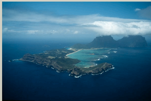
Lord Howe