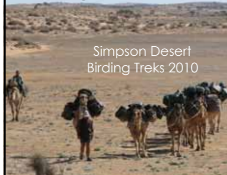
Simpson Desert Birding Treks 2010

Telephone 07 3850 7600 ade@backtrack.com.au