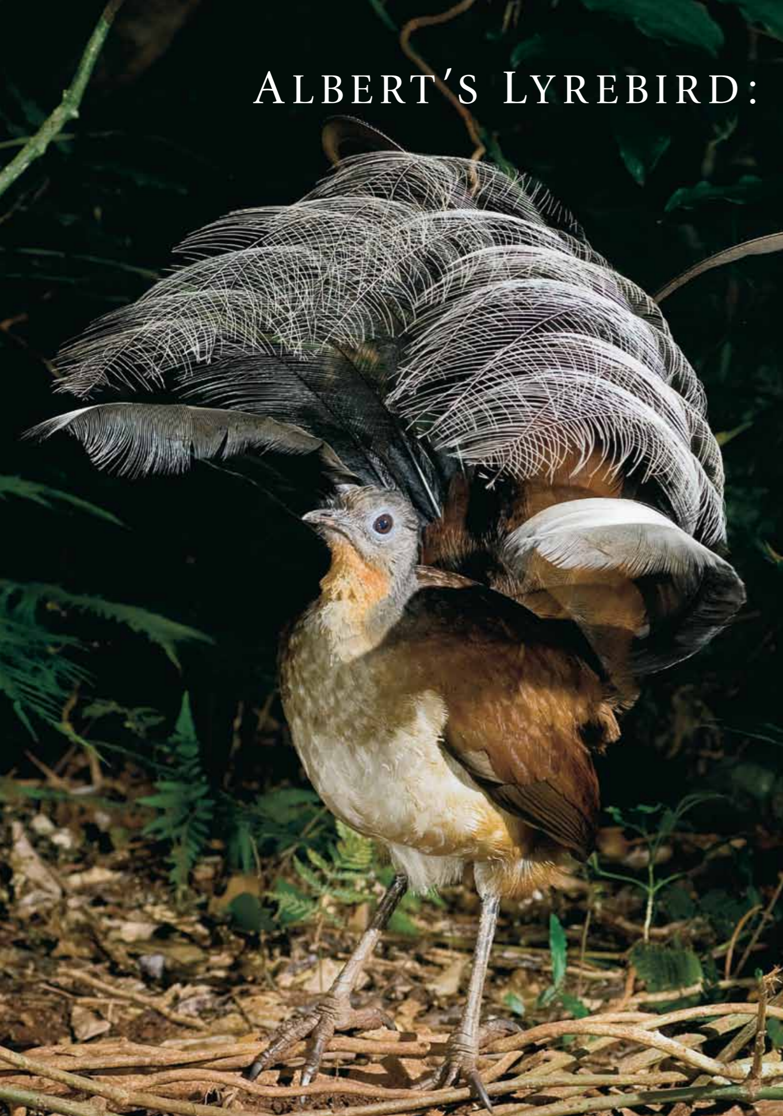
Photos: After keeping its audience waiting, the Albert's Lyrebird finally gives a bravura performance.

My attempts to photograph the displaying Albert's Lyrebird began 13 years ago, when I was living in Lamington National Park and working as a rainforest guide. I left my accommodation at 4.30 am each morning in the cold using a head-lamp to illuminate my way through the pitch-black rainforest. My friend Glen Threlfo, a nature documentary maker and renowned birder, had constructed a hide made of chicken wire and camouflage material close to a spot that a male lyrebird was favouring as a display site. I had to work quickly to set up multiple flashes around the display area and my camera inside the hide, before daybreak and the possible appearance of the lyrebird. Once confined inside the hide I would sit patiently and wait. There were often long stretches of time during which the bird didn't show up at all. Another time he began his display directly in front of me, but as soon as I moved my camera he shot off into the undergrowth. When he eventually came back—several days later—I was so careful not to be noticed... then my equipment failed. Finally, after seven long weeks, everything came together. The lyrebird turned up,